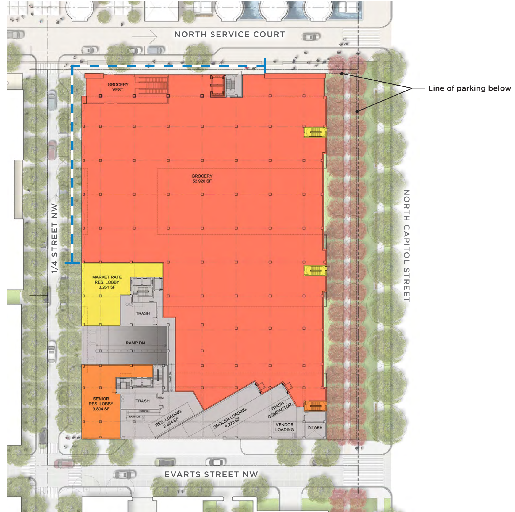
STREET LEVEL PLAN