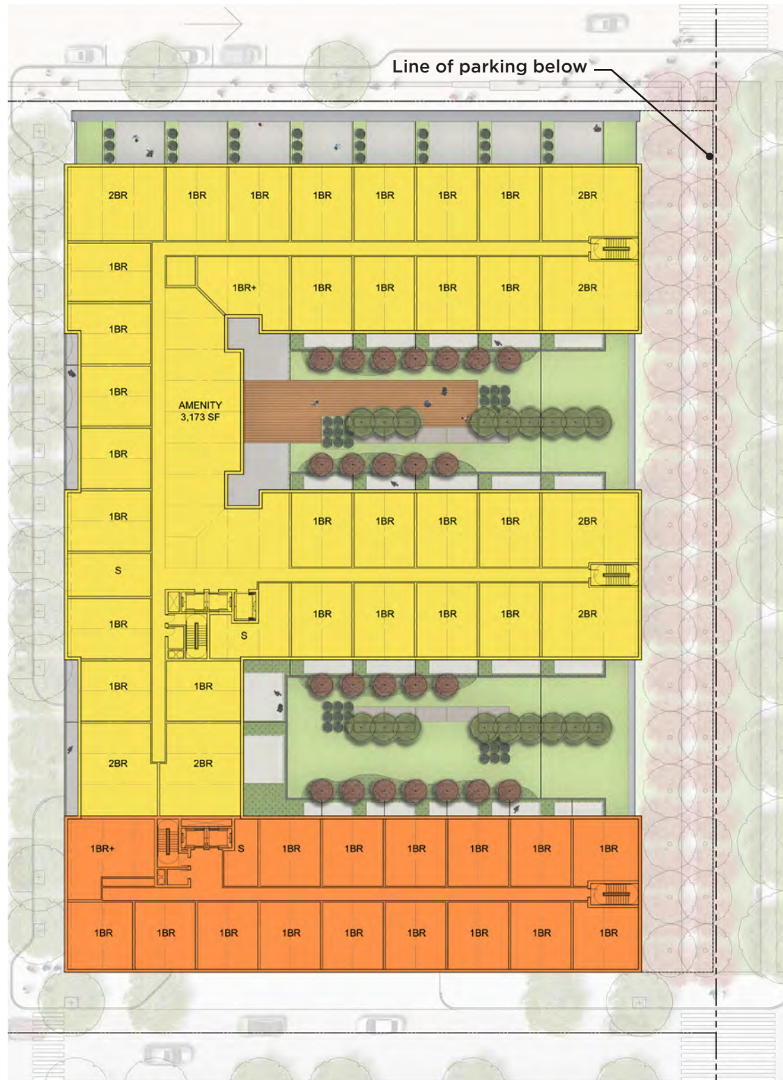
LEVEL 2 PLAN