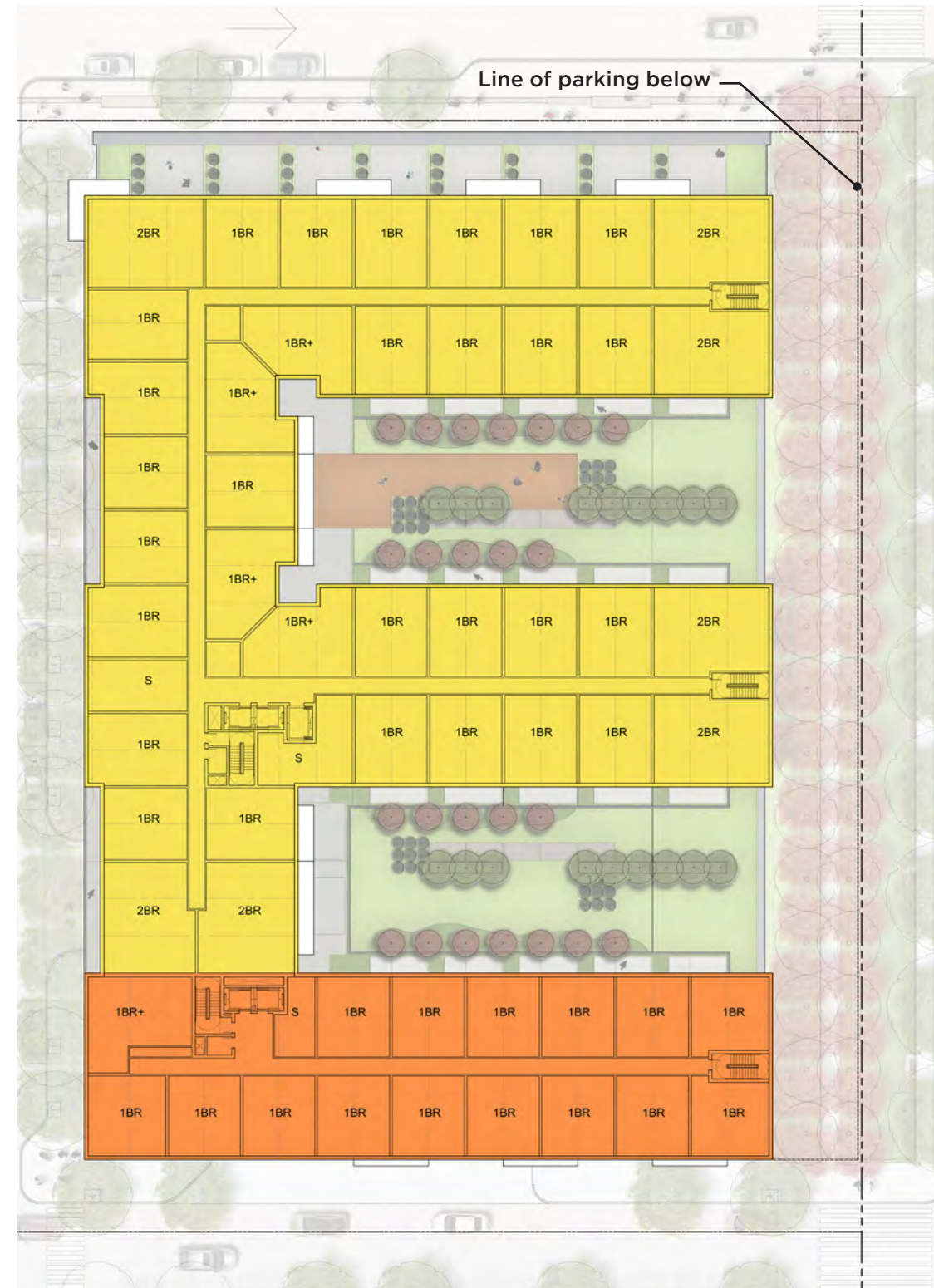
LEVELS 3-6 PLAN